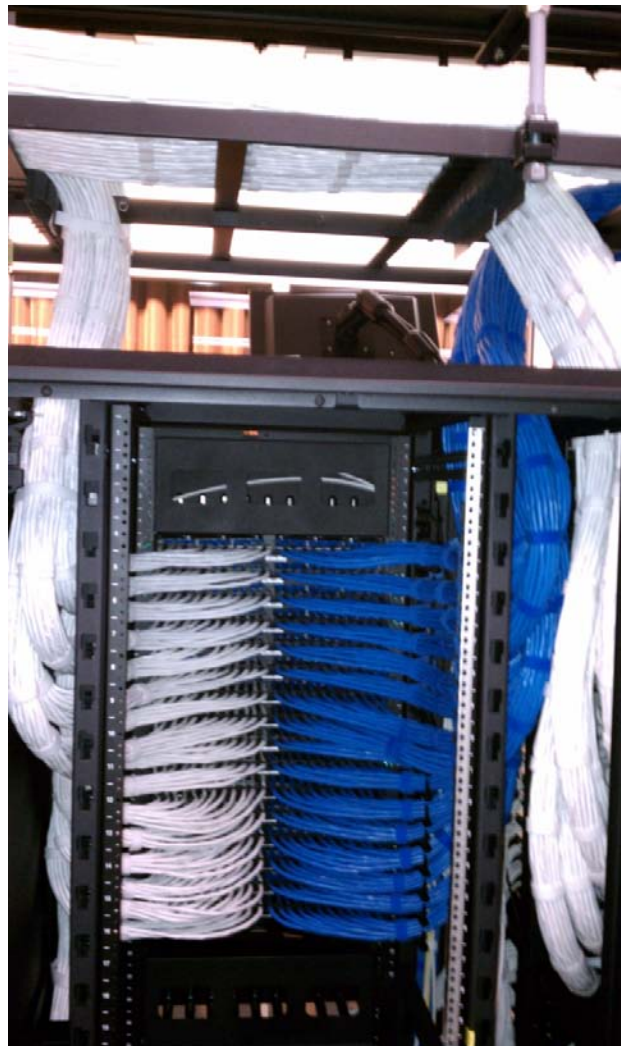
Figure 2. Switch Cabinet Patching Fields

Figure 2 shows the rear view of the patching fields for the switch. 192 cables each in white and blue enter the patching field. Patch cords are used on the reverse side of the cabinet to connect to the switch.