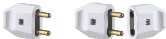
1208 / 1209