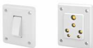
1801 / 1802